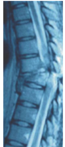
Image of Separated Spinal Cord of an Adult

Upon examination, a patient is assigned a level of injury depending on the location of the spinal cord injury. Cervical level injuries cause paralysis or weakness in both arms and legs and is referred to as quadriplegia. Sometimes this type of injury is accompanied by loss of physical sensation, respiratory issues, bowel, bladder, and sexual dysfunction. Thoracic level injuries can cause paralysis or weakness of the legs (paraplegia) along with loss of physical sensation, bowel, bladder, and sexual dysfunction. In most cases, arms and hands are not affected. Lumbar level injuries result in paralysis or weakness of the legs (paraplegia). Loss of physical sensation, bowel, bladder, and sexual dysfunction can occur. The shoulder, arm, and hand functions are usually unaffected. Sacral level injuries primarily cause loss of bowel and bladder function as well as sexual dysfunction.